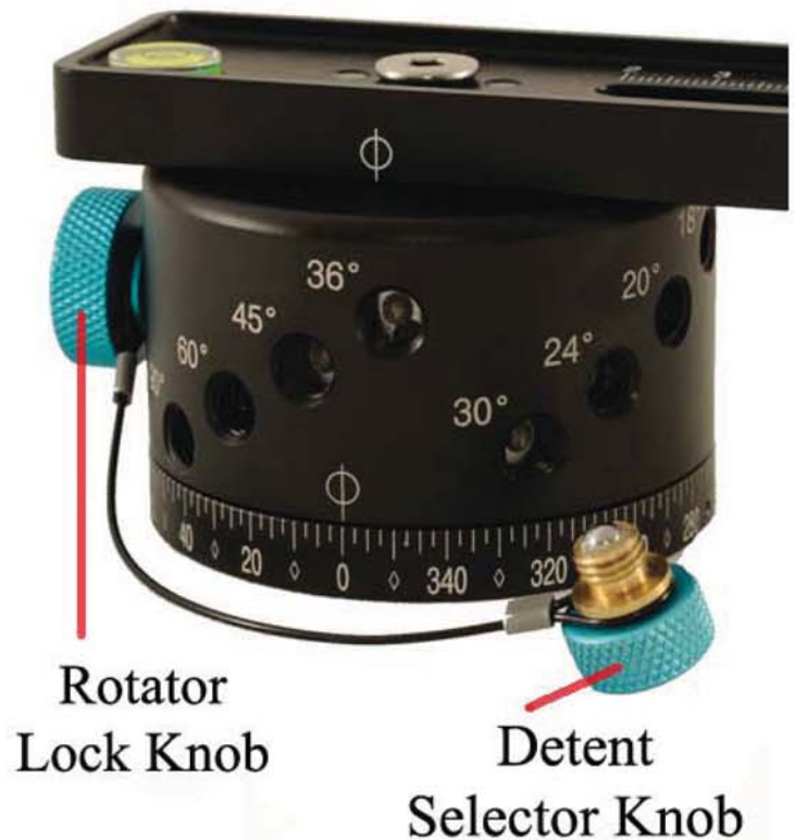
Rotator Lock Knob

note: this is a newer R-D8 with different detent options than previous version shown in images